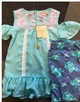
Girls' clothing set with necklace U.S. CPSC, 2018

Consumer Product Safety Commission Latest Recalls lists recent product recalls at https://www.cpsc.gov/Recalls . Search with the keyword "lead" or call 1-800-638-2772 for more information.