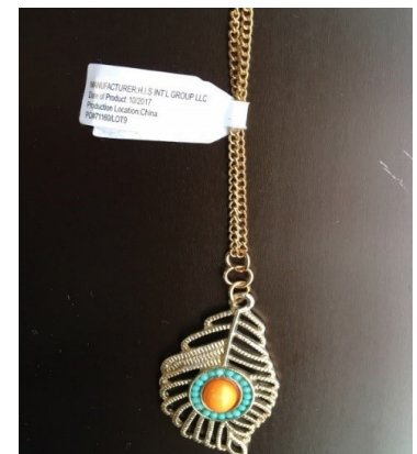
Necklace sold with clothing set U.S. CPSC, 2018