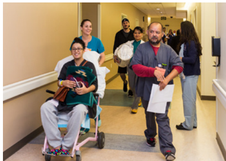
(Top) Surgeons of VCMC/SPH (Above) Patient being moved to her new room (Right) The Healing Garden

County with this particular piece of equipment, providing another benefit to surgical patients.